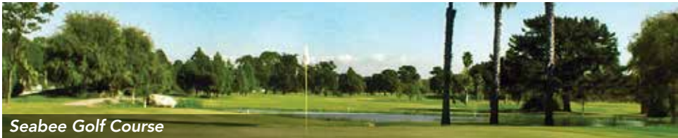
Seabee Golf Course