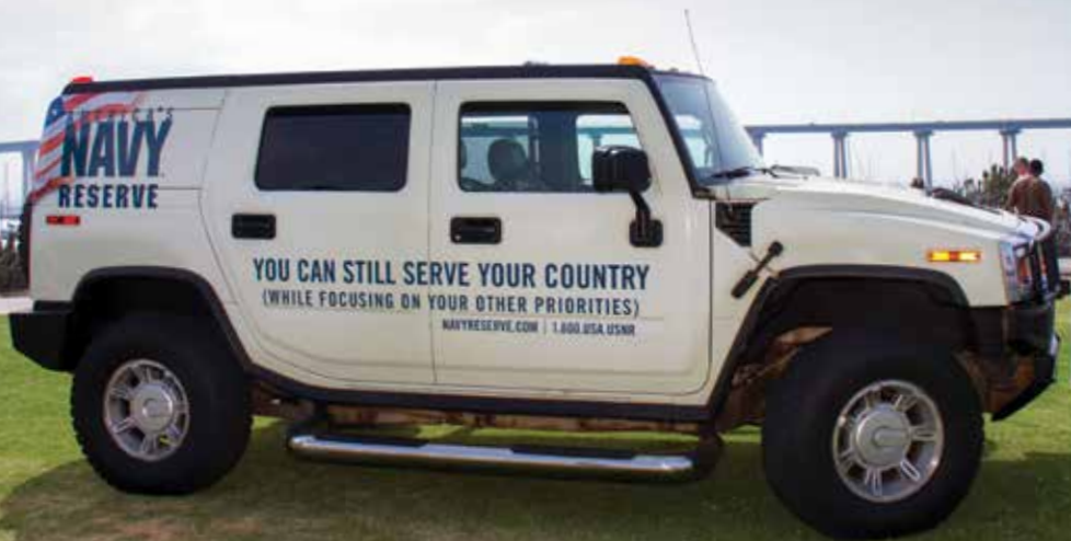
Photo representation. Actual vehicles vary.