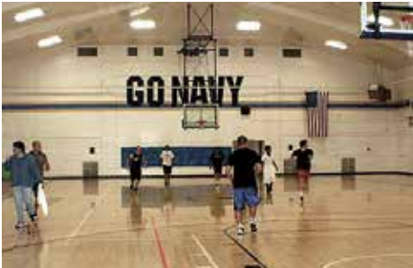
Warfield Gymnasium, Port Hueneme

*ALL PROMOTIONAL MATERIALS MUST BE APPROVED BY MWR AND PROVIDED BY ADVERTISER*